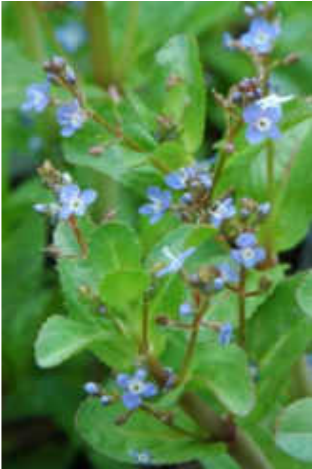
Veronica beccabunga - brooklime