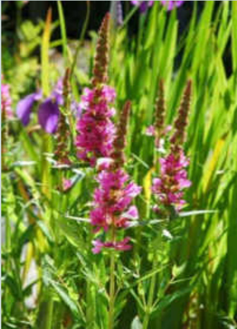
Lythrum s. ,Robert‘