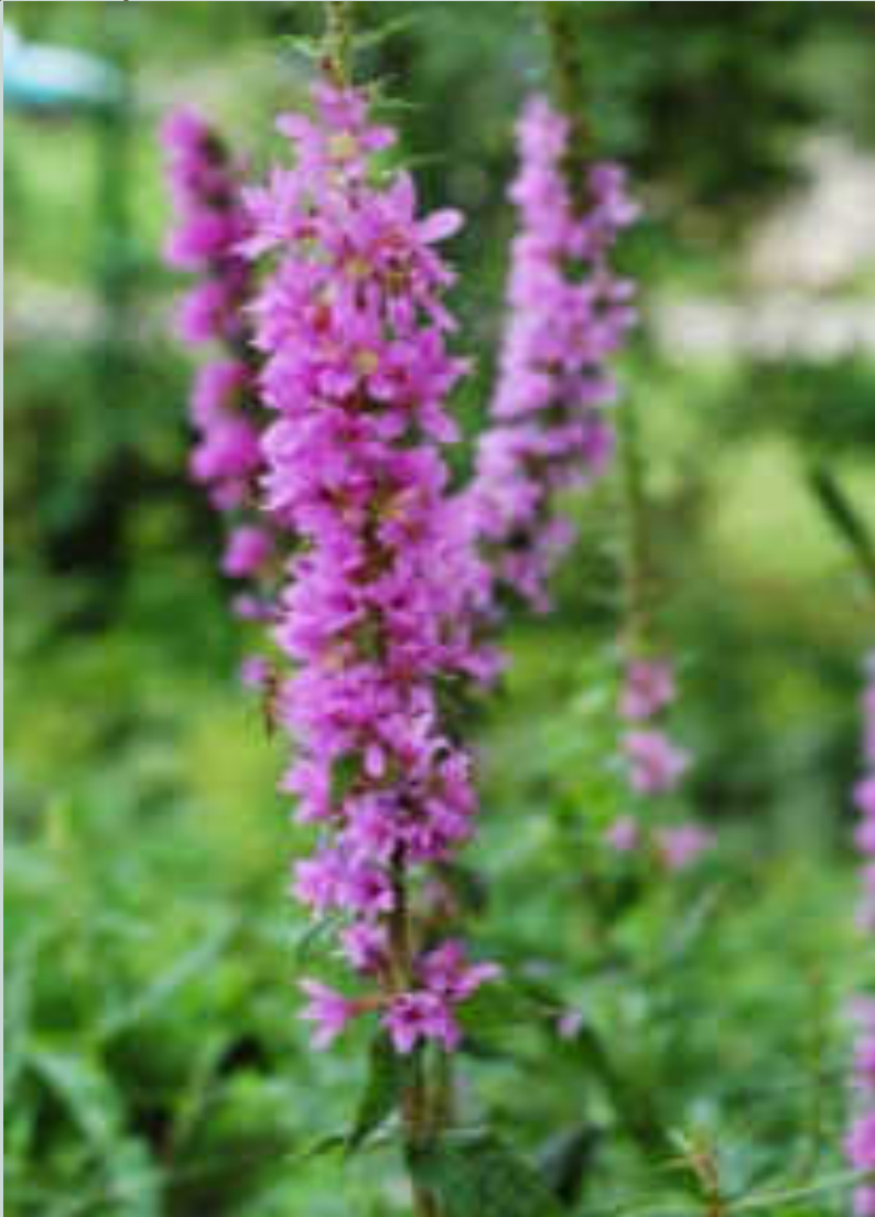
Lythrum salicaria purple loosestrife